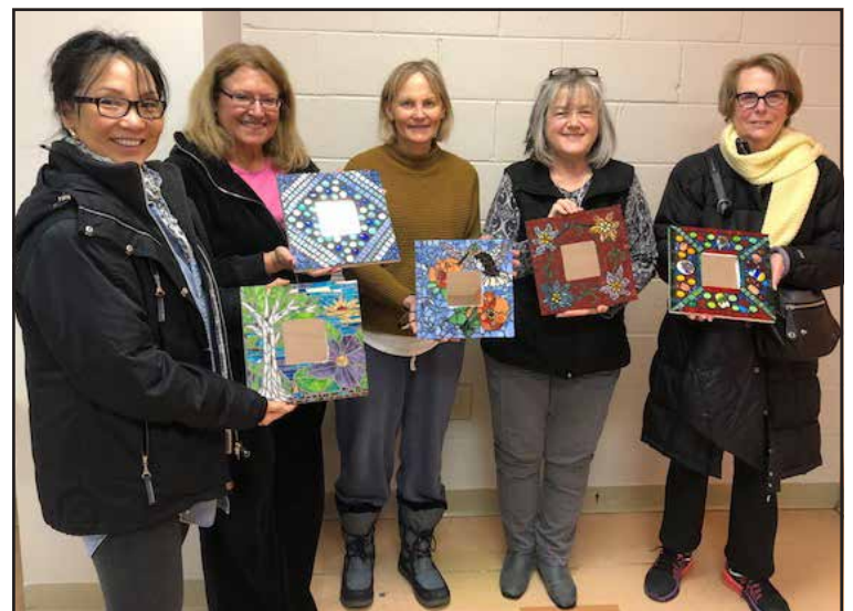
Participants from the recent Mosaics for Beginners class showing off their finished artwork.

Travel back in time to the 1960s when Frank Sinatra, Dean Martin, Sammy Davis Jr. and Joey Bishop, known as the Rat Pack, ruled the Las Vegas Strip.