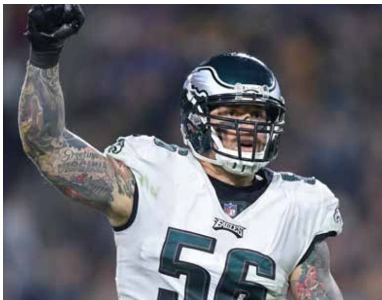
Sports Night Special Guest Speaker: 2018 NFL Man of the Year Chris Long